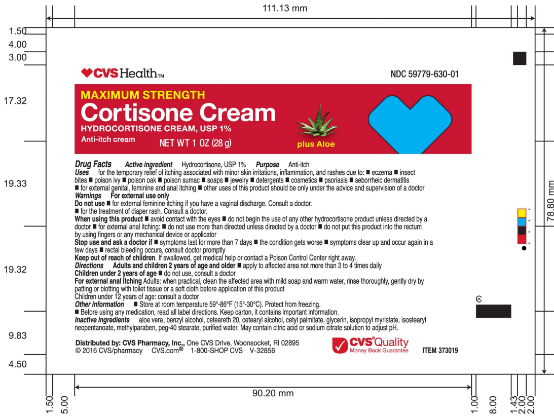
Carton Label | 2oz