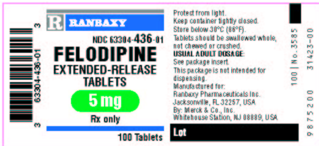
5 mg - 100'S BOTTLE LABEL