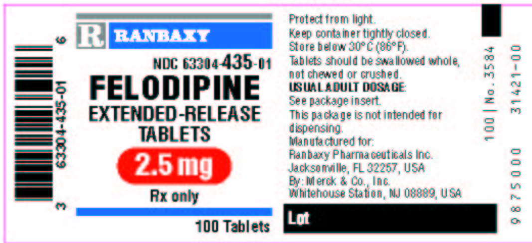
2.5 mg_- 100'S BOTTLE LABEL