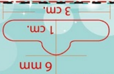
ANTIBACTERIAL HAND WIPES benzalkonium chloride cloth