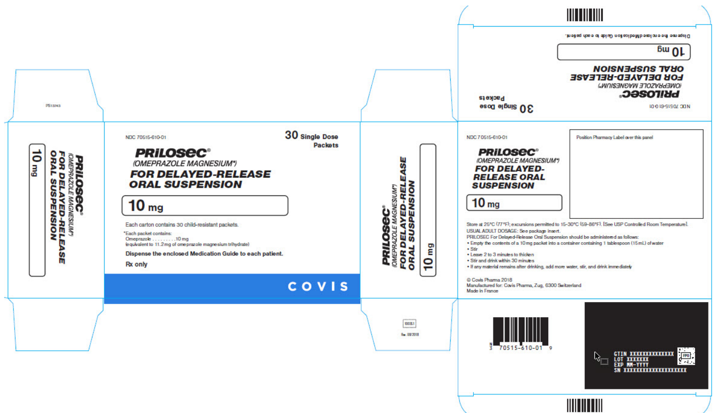
10 mg Carton Label