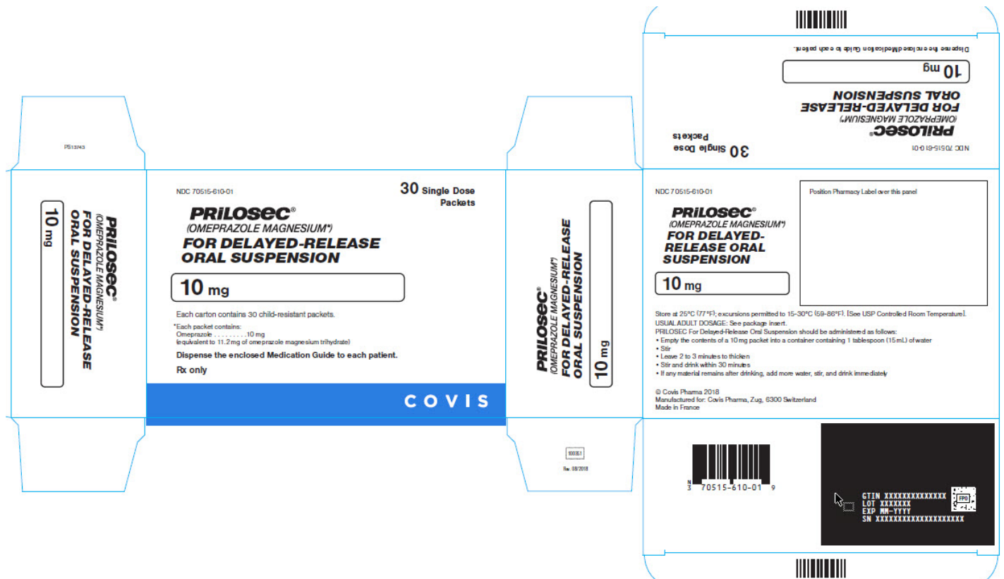
10 mg Carton Label