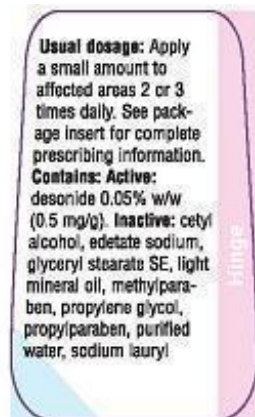
Inside - Panel 2