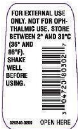
Top - Panel 1