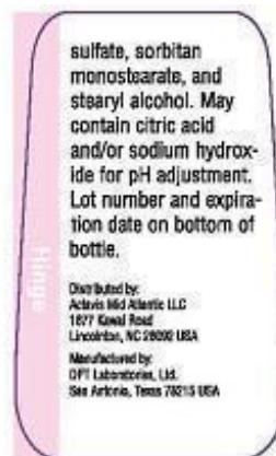
Base - Panel 3