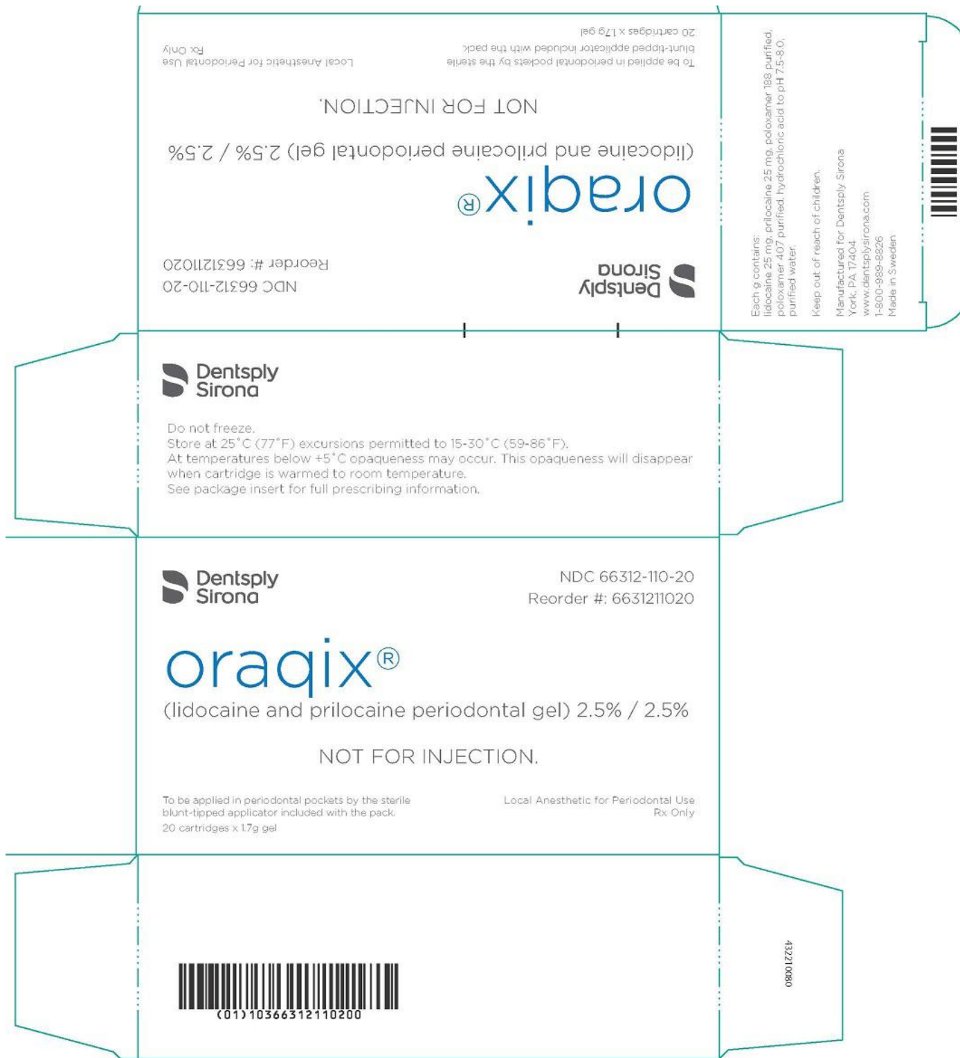
Principal Display Panel - Dispenser Carton