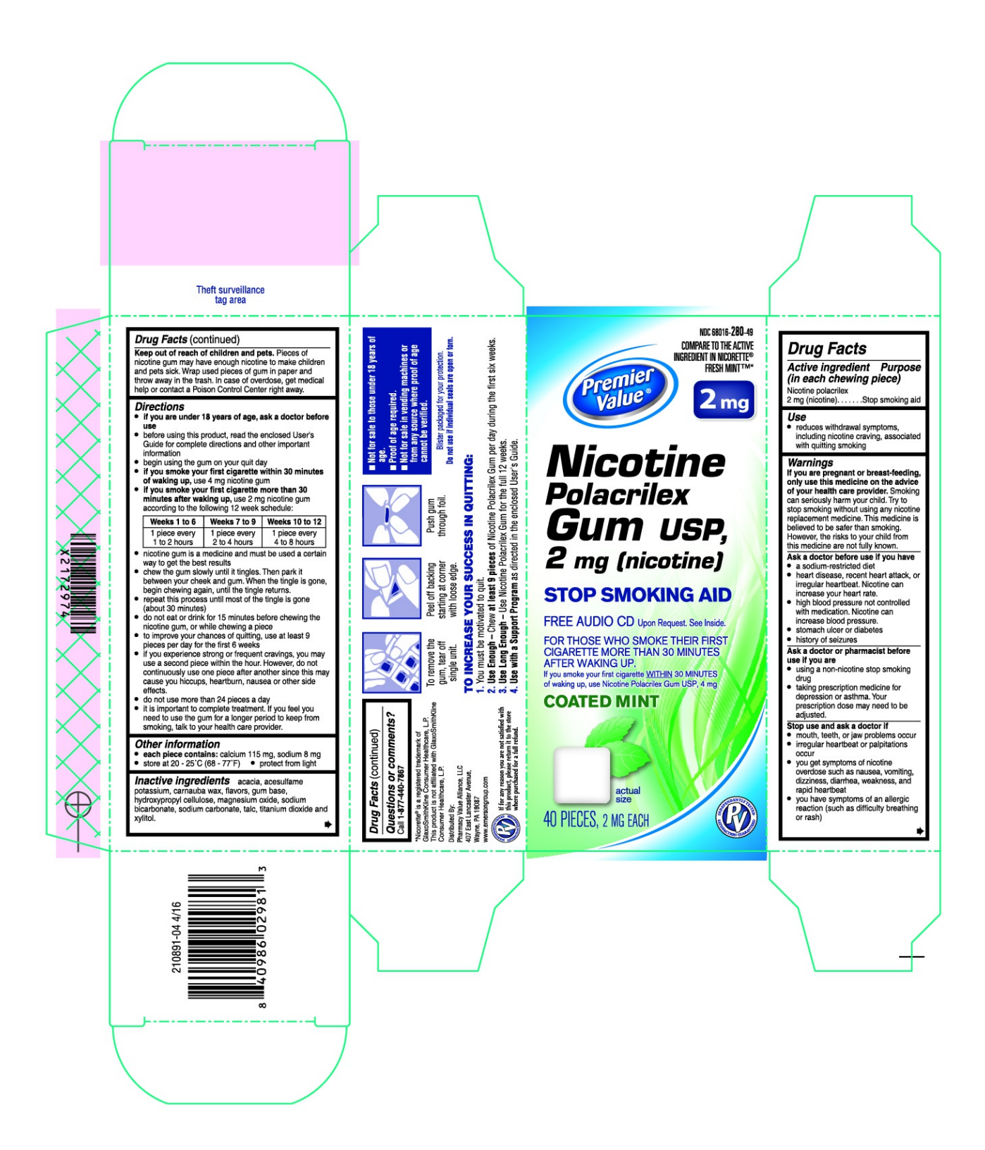
PRIMIER VALUE Nicotine Gum Coated Mint