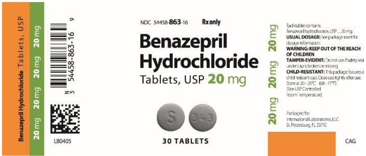
Benazepril Hydrochloride Tablets, USP 20mg