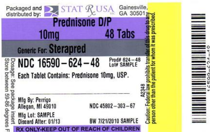
PREDNISONE 48 DP 10MG