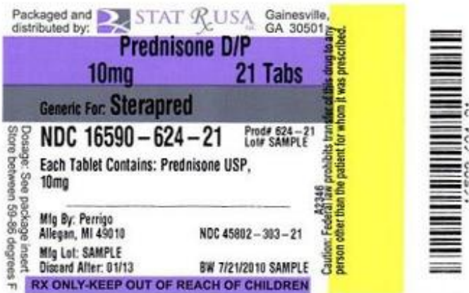
PREDNISONE 21 DP 10MG LABEL IMAGE