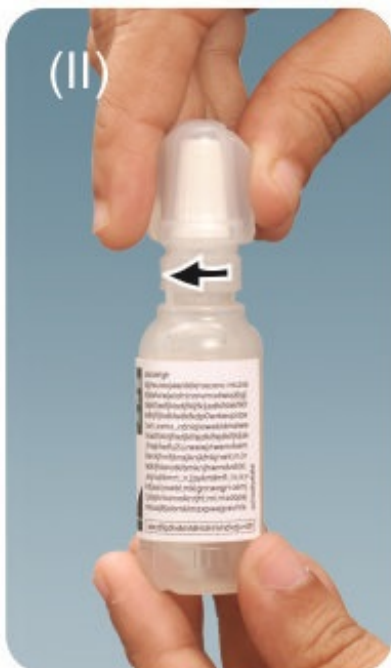
Snap off the dust cover by turning it clockwise to break the seal