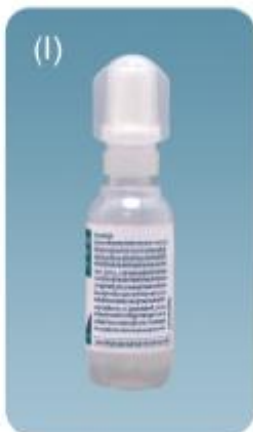
Bottle as you receive it