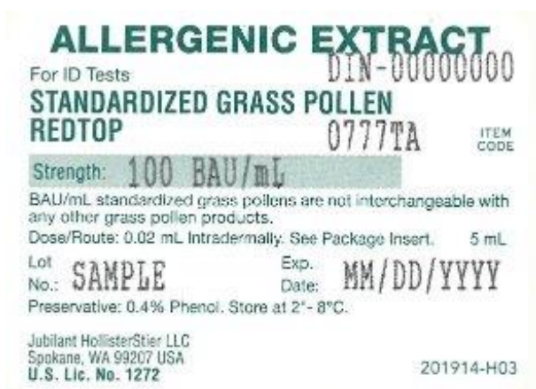
Redtop 100 BAU/mL