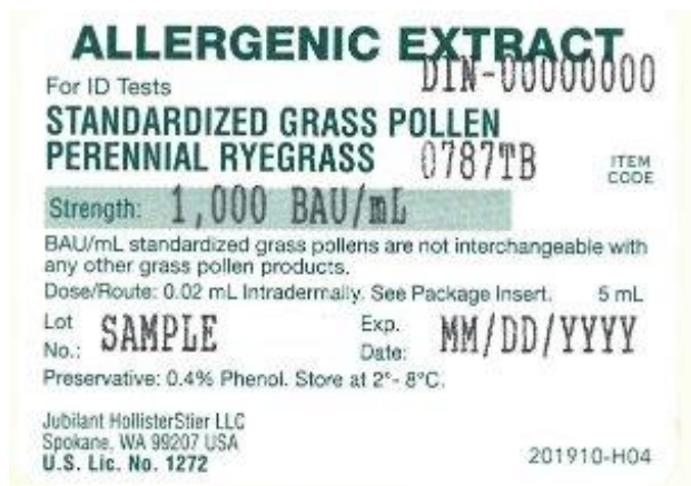
Perennial Ryegrass 1,000 BAU/mL