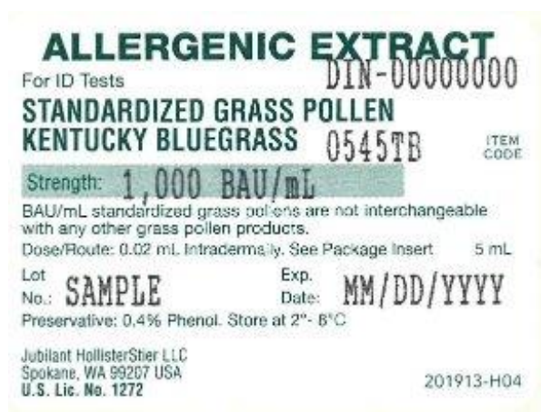
Kentucky Bluegrass 1,000 BAU/mL