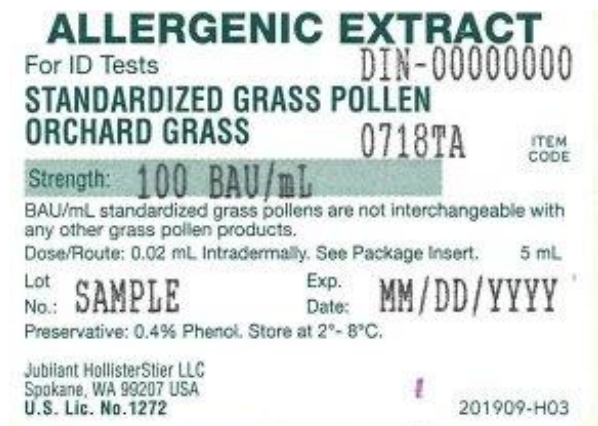
Image - Orchard Grass 100 BAU/mL