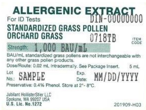
Orchard Grass 1,000 BAU/mL