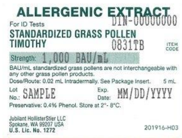
Timothy 1,000 BAU/mL