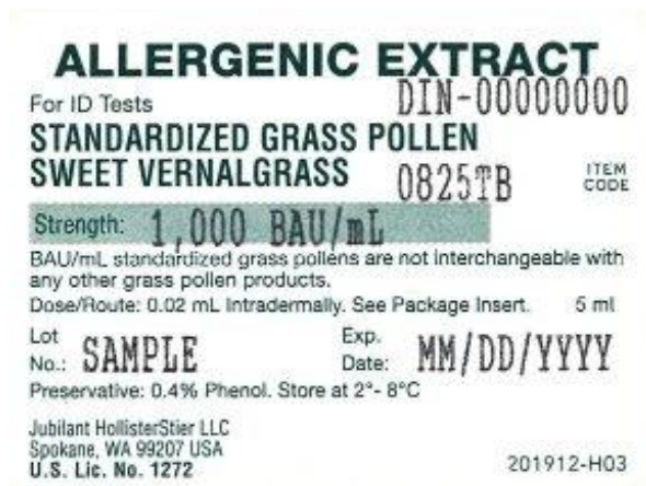
Sweet Vernalgrass 1,000 BAU/mL