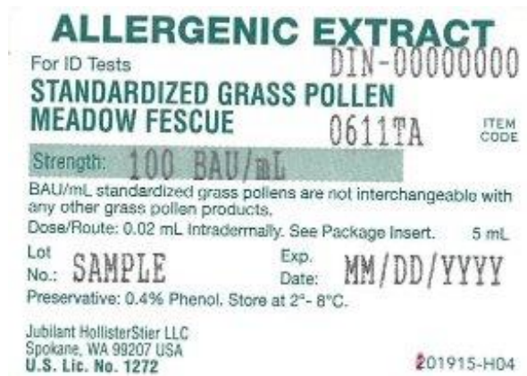
Image - Meadow Fescue 100 BAU/mL