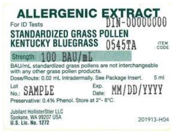
Kentucky Bluegrass 100 BAU/mL