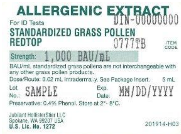
Redtop 1,000 BAU/mL