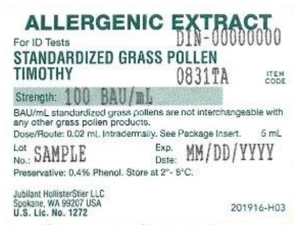
Timothy 100 BAU/mL