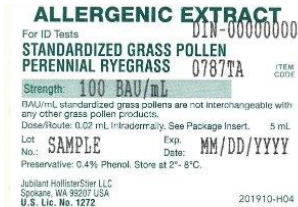
Perennial Ryegrass 100 BAU/mL