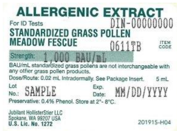
Image - Meadow Fescue 1,000 BAU/mL