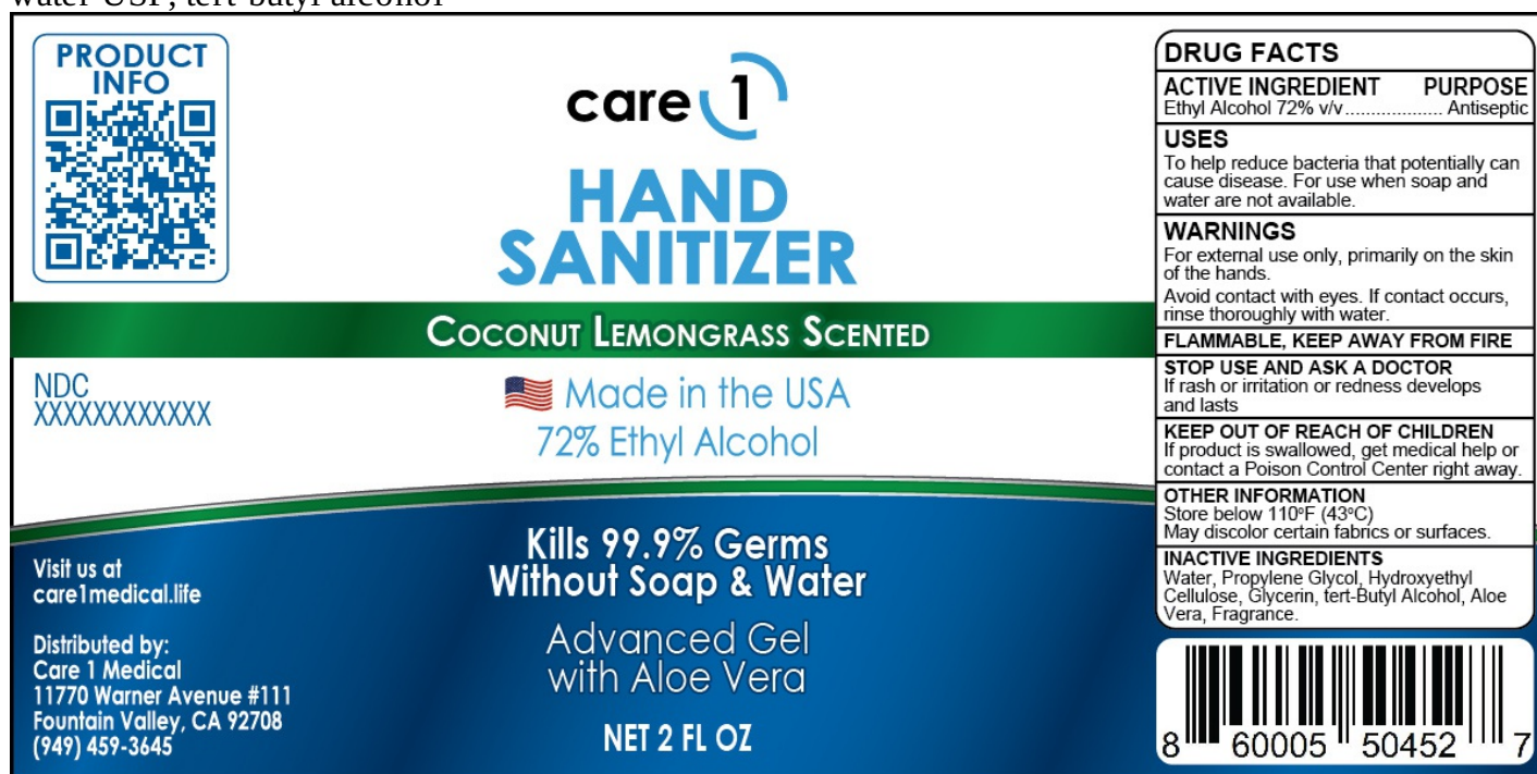
Package Label - Principal Display Panel

glycerin, coconut, aloe, propanediol, hydroxypropyl cellulose, cymbopogon citratus leaf, purified water USP, tert-butyl alcohol