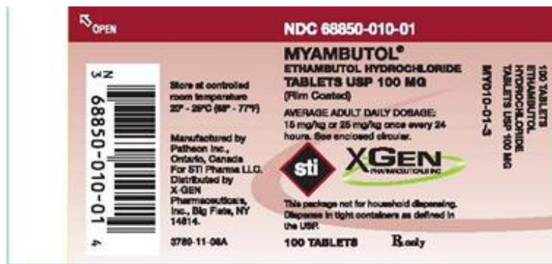
100 mg bottle label