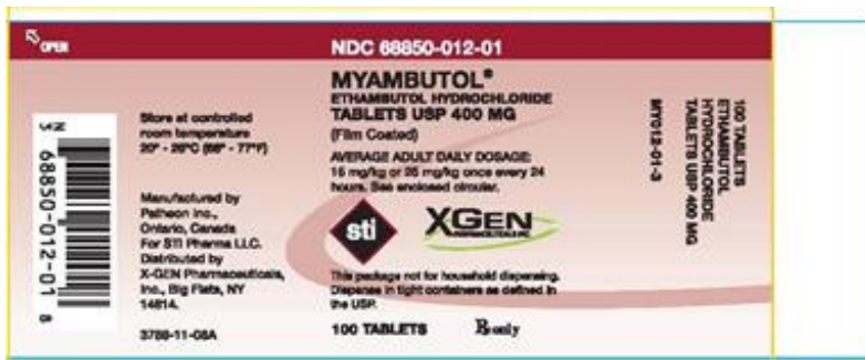
400 mg bottle label