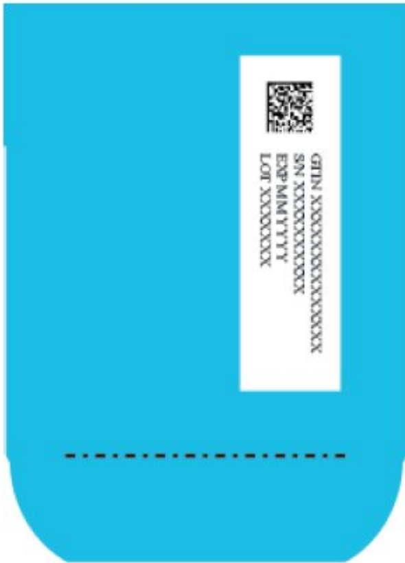
PRINCIPAL DISPLAY PANEL - 10 mg NDC 51079-286-20