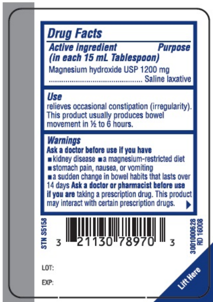
Top Ply (Page #1)