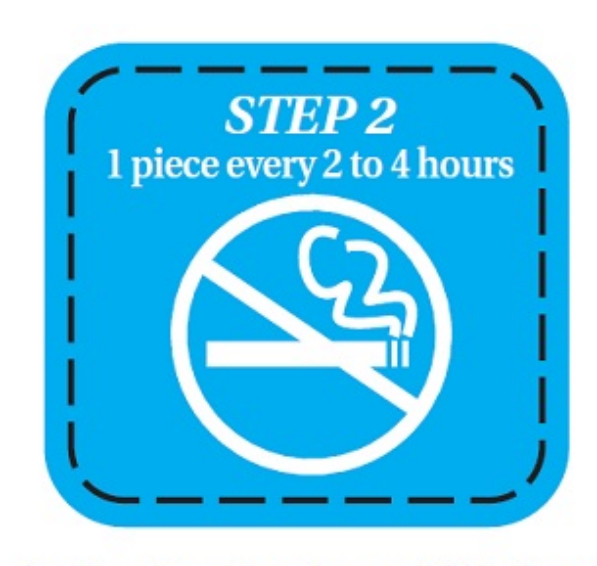
At the Beginning of Week #7