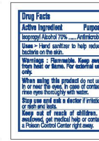
PEEL OFF STICKER (INSIDE)