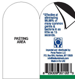
PEEL OFF STICKER (OUTSIDE)