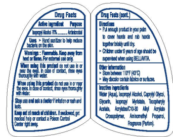
PEEL OFF STICKER (INSIDE)