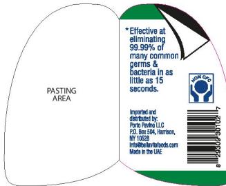
PEEL OFF STICKER (OUTSIDE)