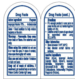
PEEL OFF STICKER (INSIDE)