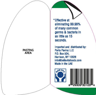
PEEL OFF STICKER (OUTSIDE)