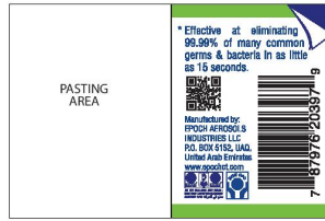
PEEL OFF STICKER (OUTSIDE)