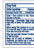
PEEL OFF STICKER (INSIDE)