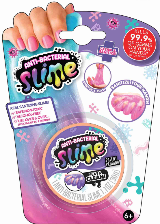
FRONT VIEW WITH CONTAINER STICKER