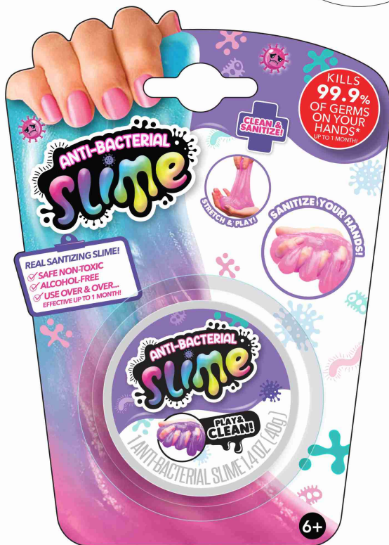
FRONT VIEW WITH CONTAINER STICKER