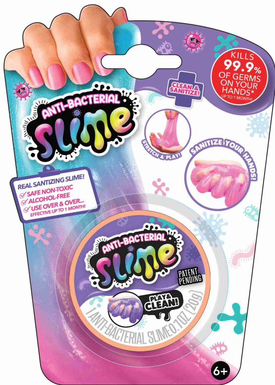
FRONT VIEW WITH CONTAINER STICKER