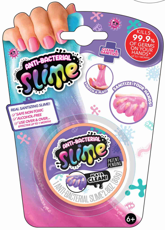
FRONT VIEW WITH CONTAINER STICKER