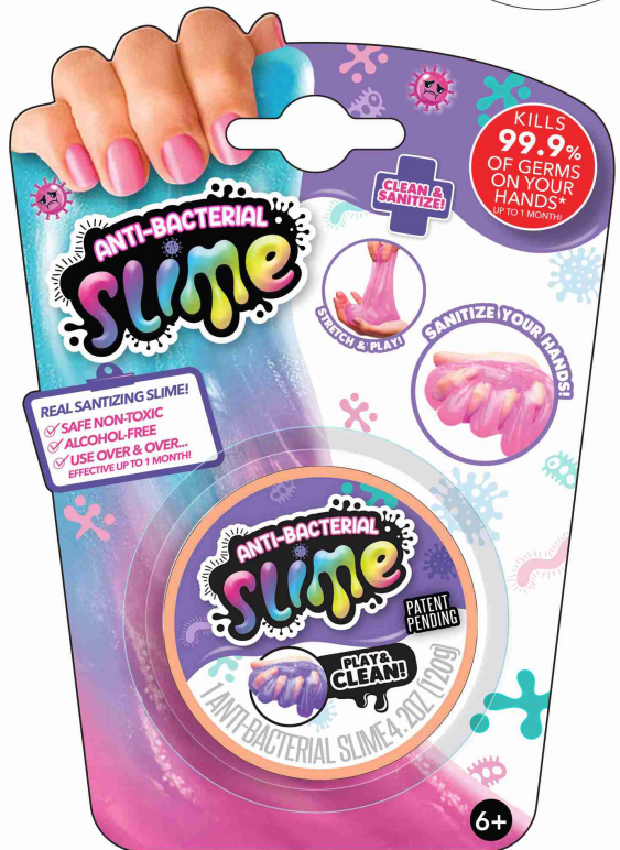
FRONT VIEW WITH CONTAINER STICKER