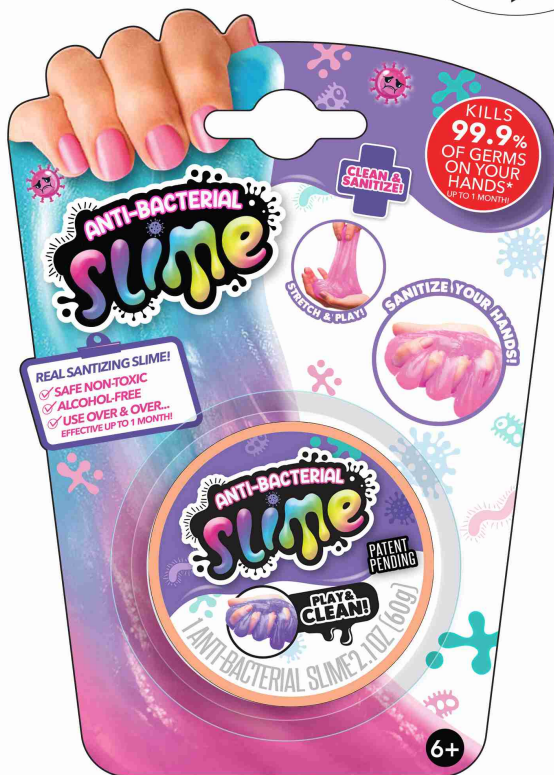
FRONT VIEW WITH CONTAINER STICKER

Drug Facts (Continued) Other Information store in room temperature (25 C / 77 F) avoid freezing and excessive heat above 70 C (158 F) Inactive Ingredients Hydroxypropyl Guar, Sodium Borate, Propylene glycol, Iodopropynyl Butylcarbamate, 2-Phenoxyethanol, Diazolidinyl Urea, pigment, silver solution-C, Aqua. -Styles and colors of contents may vary from pictures. -Contents contain colorants that may stain certain surfaces.