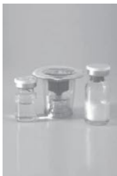
Table 1 COAGADEX Reconstitution Instructions