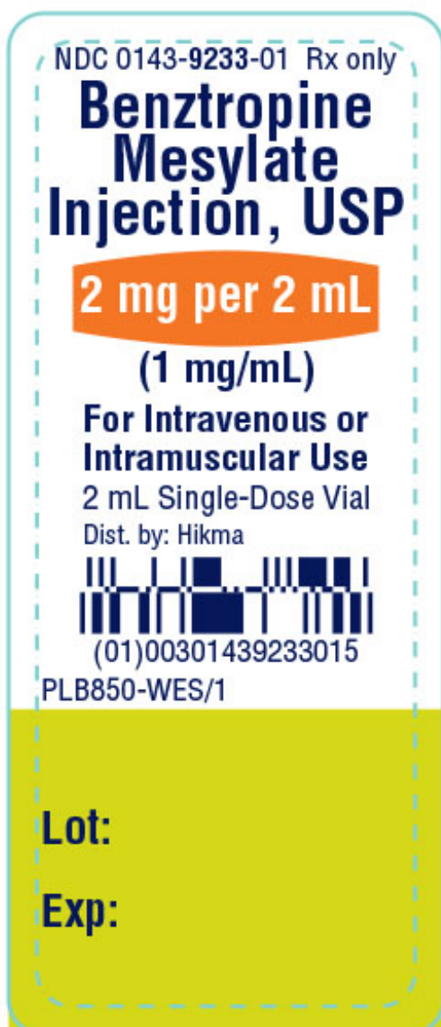
Benztropine Mesylate Injection, USP Container Label