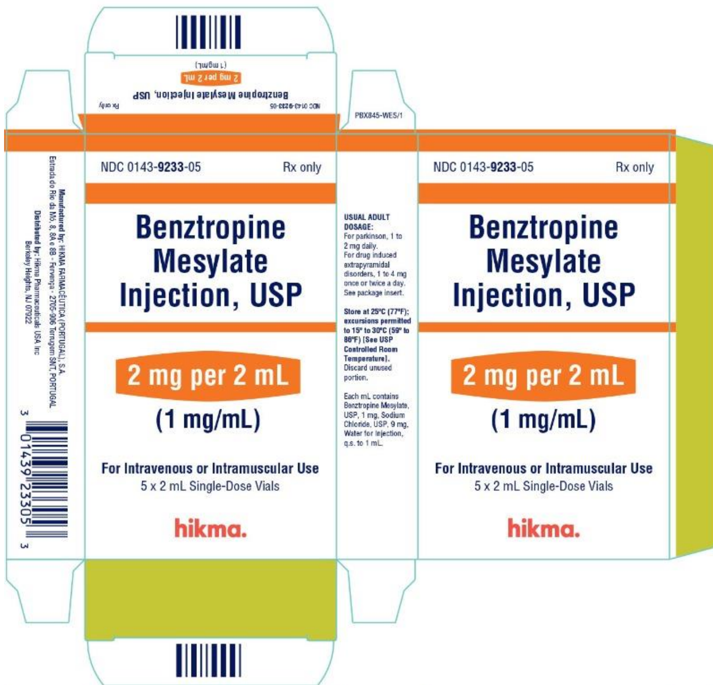
Benztropine Mesylate Injection, USP Carton Label