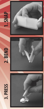
HOW TO OPEN THE SNAP PACKET