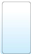
BACK LABEL ADHESIVE SIDE SHOWS THROUGH THE BOTTLE