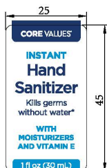
FRONT LABEL CLEAR STOCK