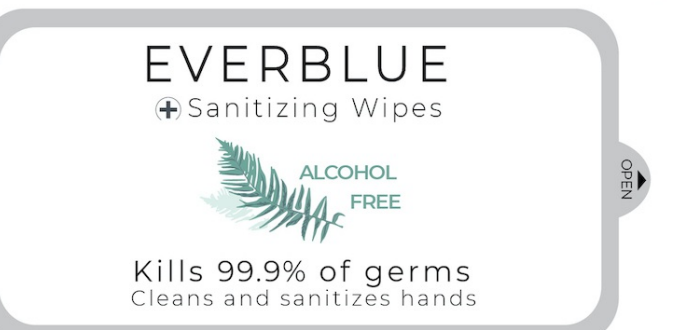
premium non -woven sheet