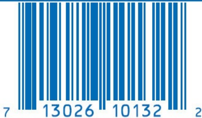
Product Package Outer Label B

Made in Israel. www.nidaria.com US Patents No. 6338837 / 6406709 / 6132747