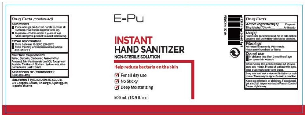
Cover Label (240 x 88 mm)