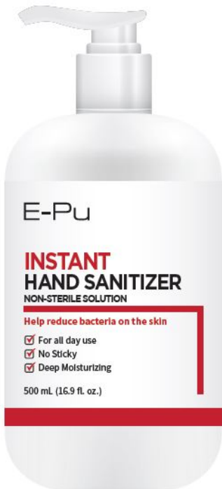
70% 500ml Gel

Do not use-in children less than 2 months of age, on open skin wounds