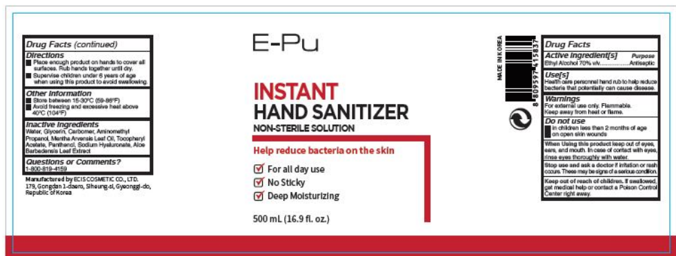
Cover Label (240 x 88 mm)