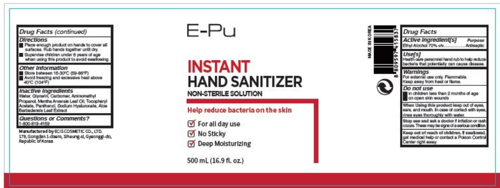
Cover Label (240 x 88 mm)