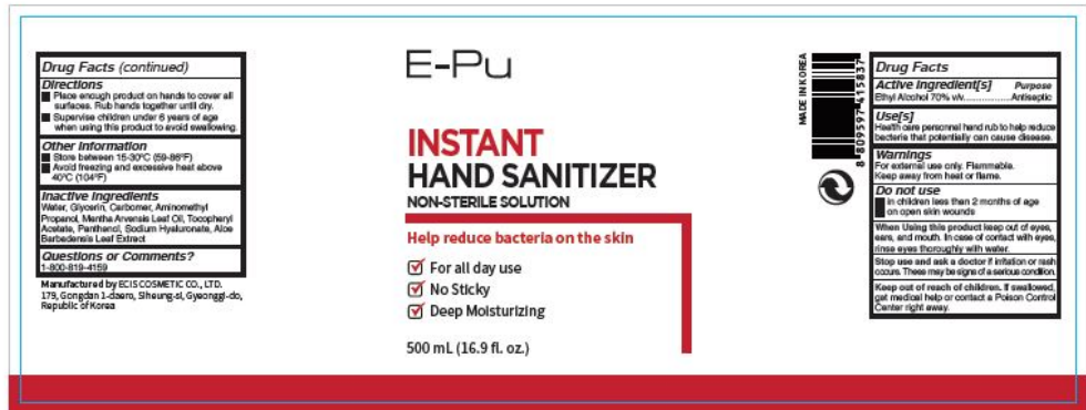
Cover Label (240 x 88 mm)