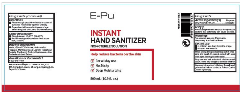
Cover Label (240 x 88 mm)