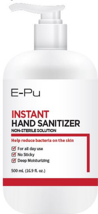
70% 500ml Gel