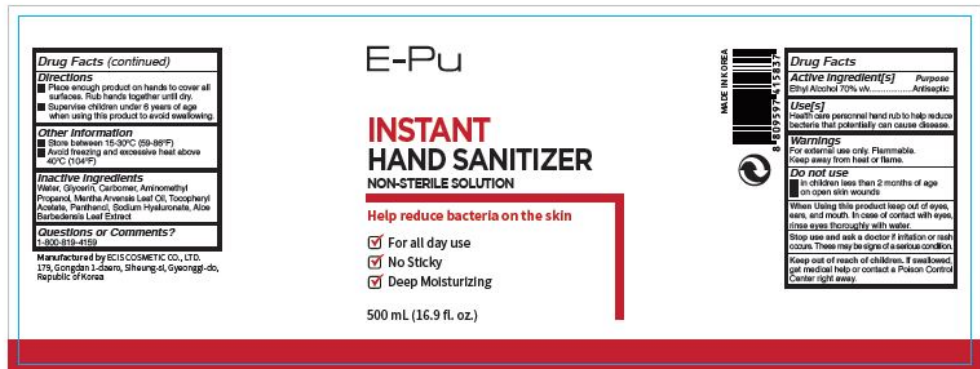
Cover Label (240 x 88 mm)