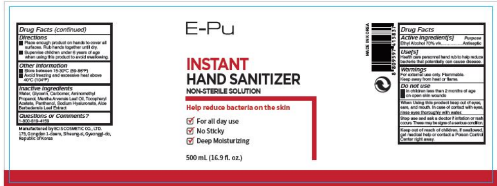
Cover Label (240 x 88 mm)