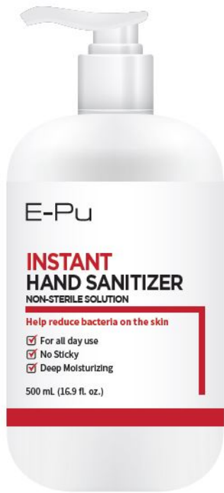
70% 500ml Gel