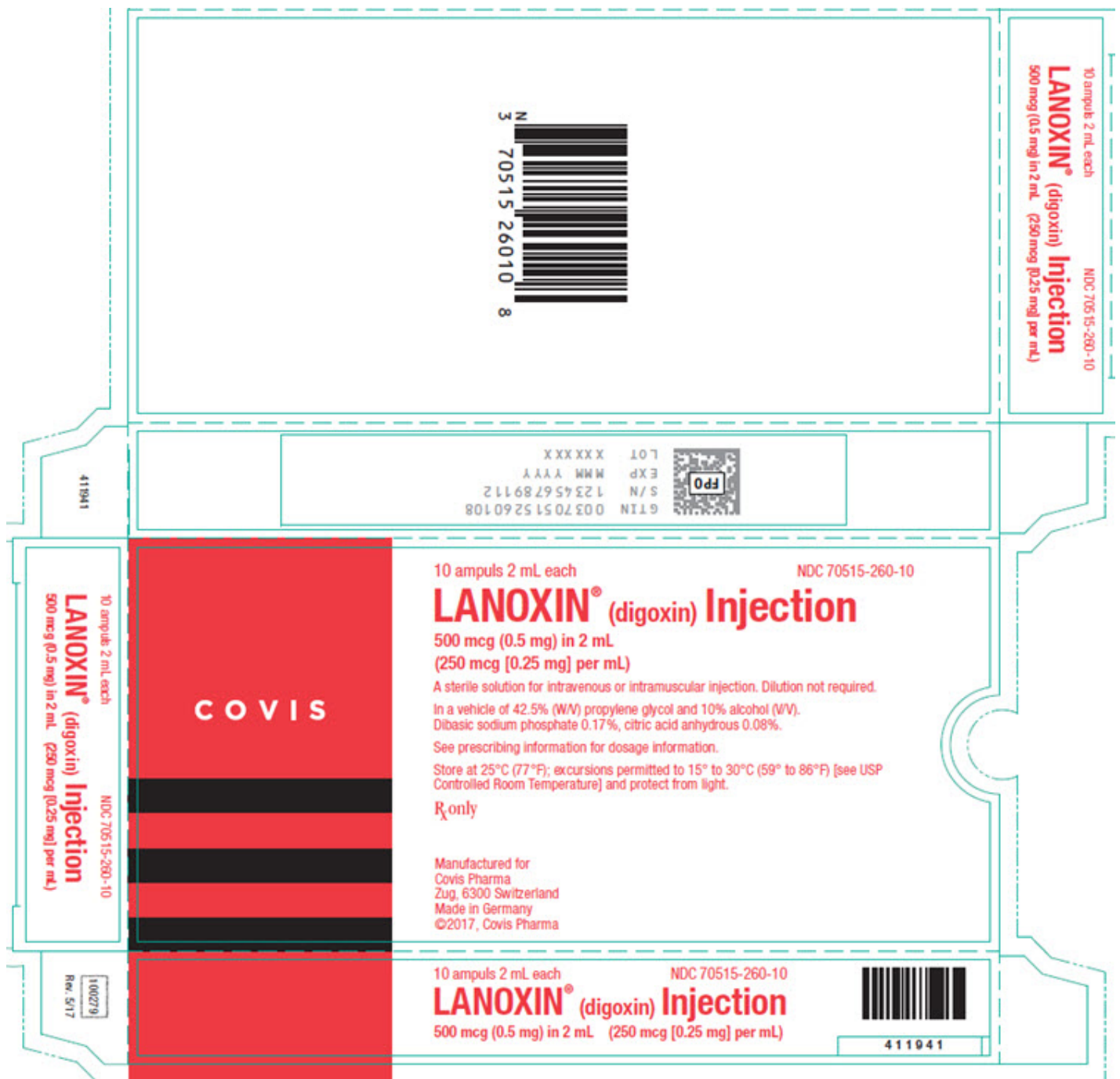
Adult Carton Label - Ampule