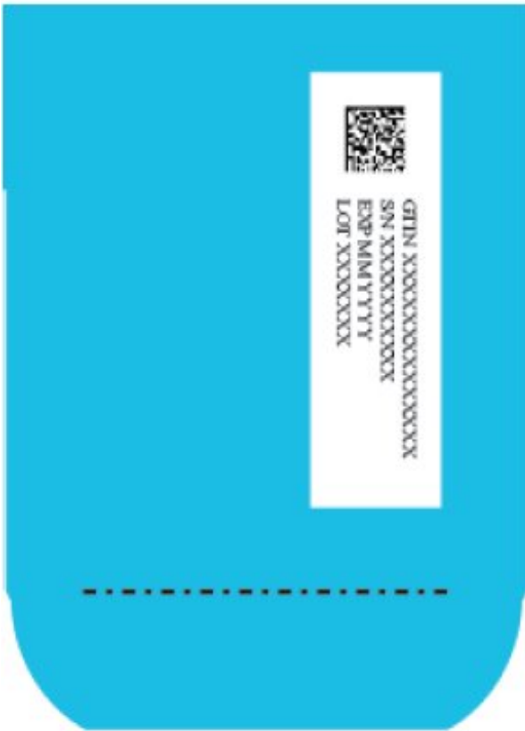
PRINCIPAL DISPLAY PANEL - 50 mg NDC 51079-801-20