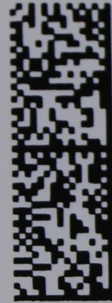
Principal Display Panel - 51662-1396-2 - Pouch Labeling