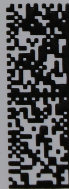
NDC 51662-1606=3 CASE LABEL