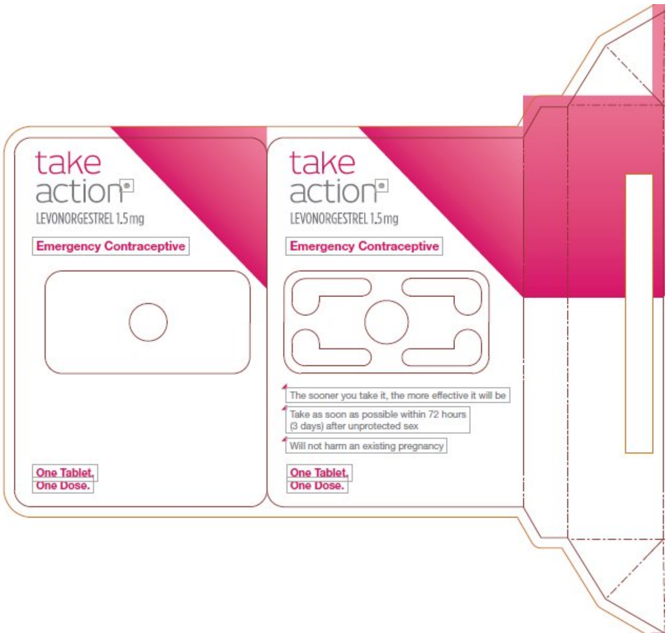
Principal Display Panel, Part 2 of 3