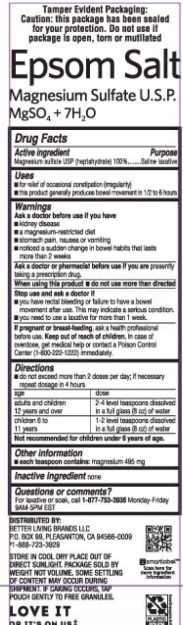
SIGNATURE CARE Epsom Salt