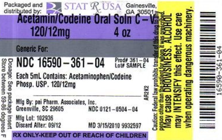
APAP-CODEINE ORAL SOLN