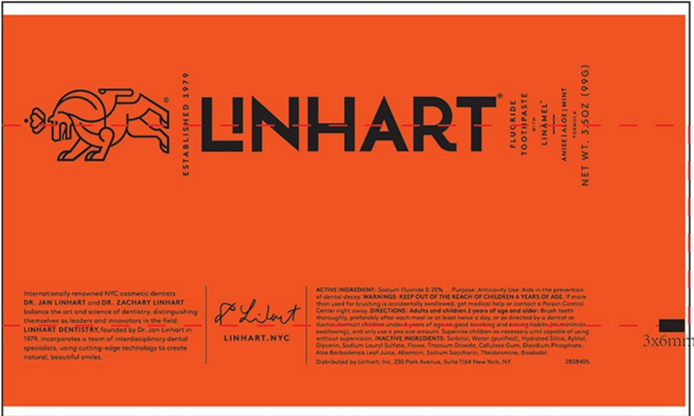
LINHART with Linamel Fluoride Toothpaste NET WT 3.5oz (99g)