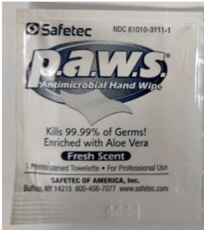
Alcohol Wipe Principal Display Panel