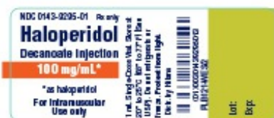
Haloperidol Decanoate Injection 100 mg/mL container label