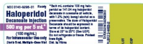
Haloperidol Decanoate Injection 500 mg per 5 mL container label