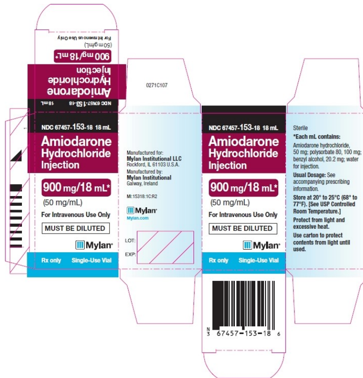
PRINCIPAL DISPLAY PANEL, SERIALIZED CARTON LABEL