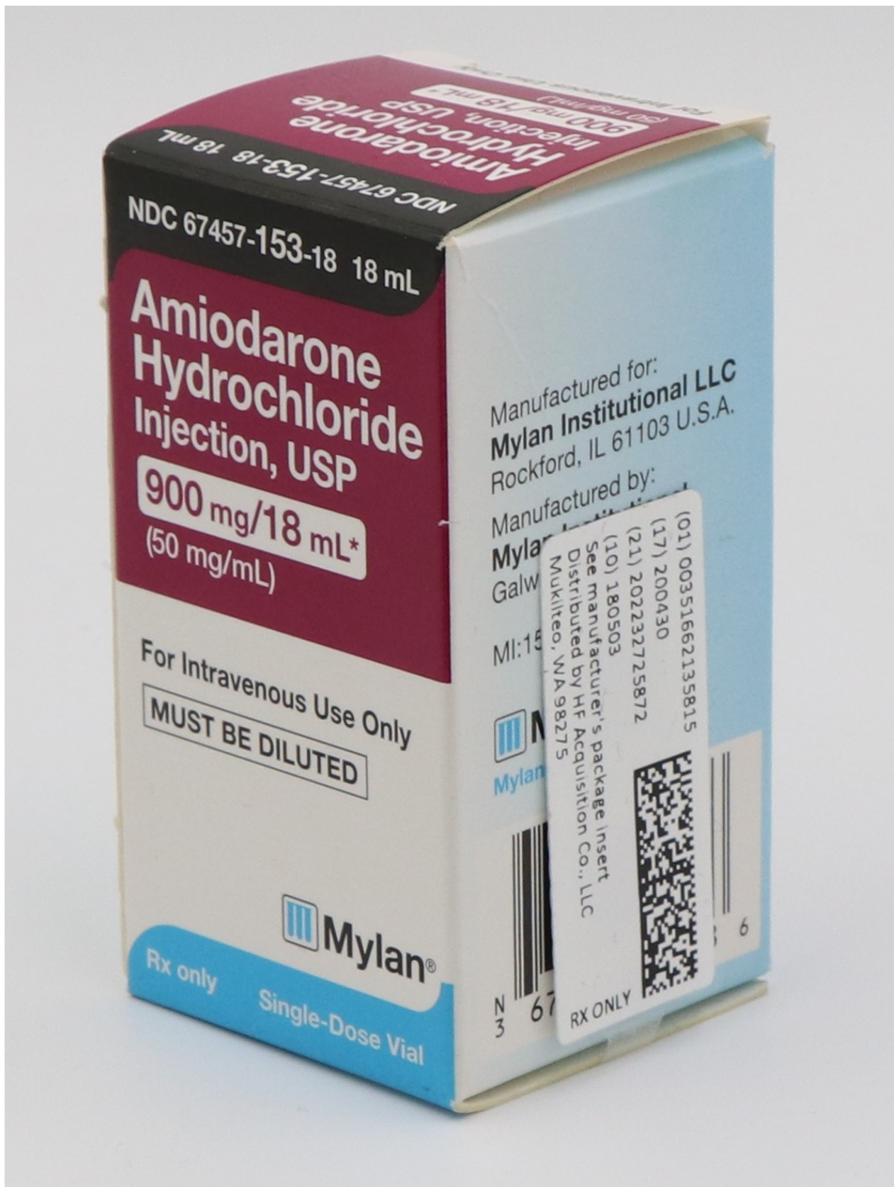
PRINCIPAL DISPLAY PANEL, VIAL LABELING