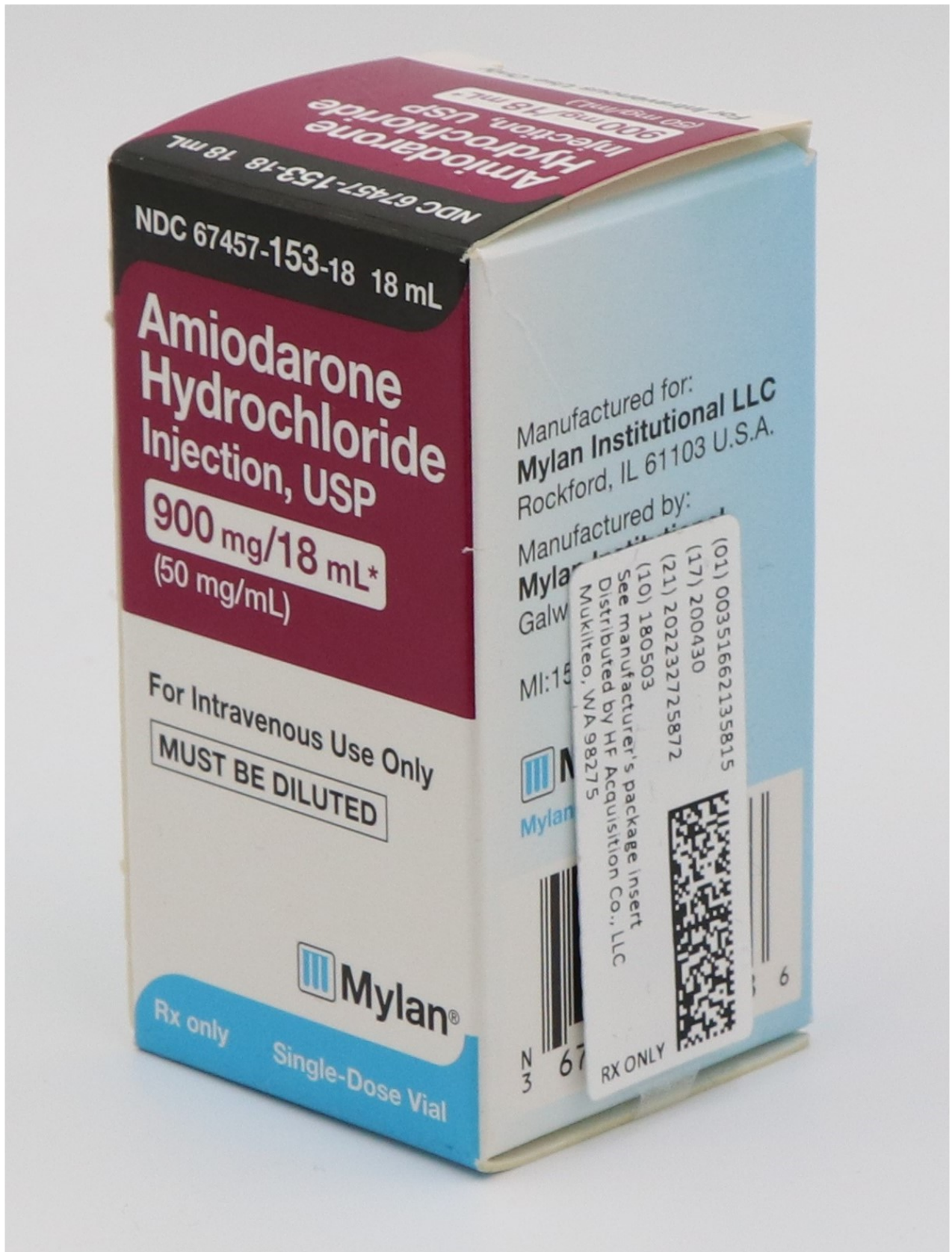
PRINCIPAL DISPLAY PANEL, VIAL LABELING