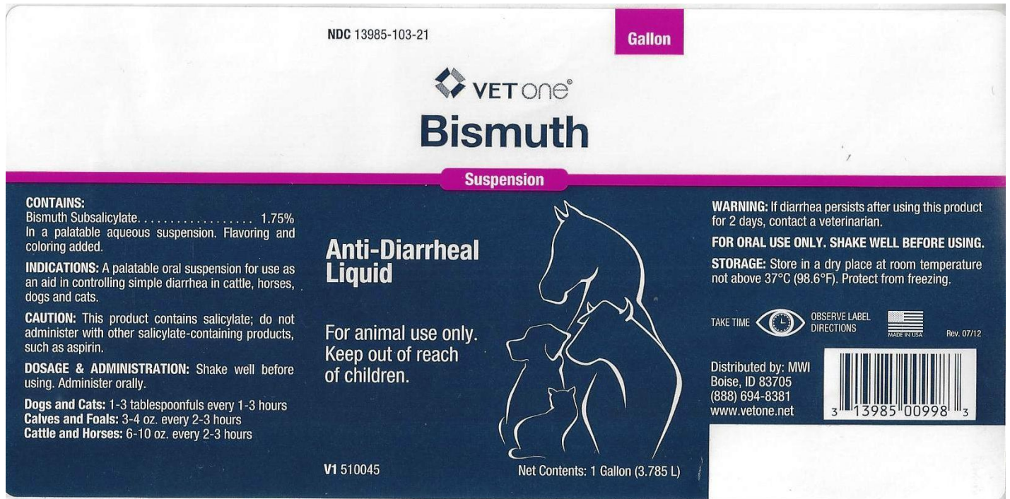
Bottle Label Bottle Label