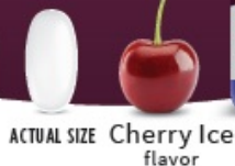
ACTUAL SIZE Cherry Ice flavor