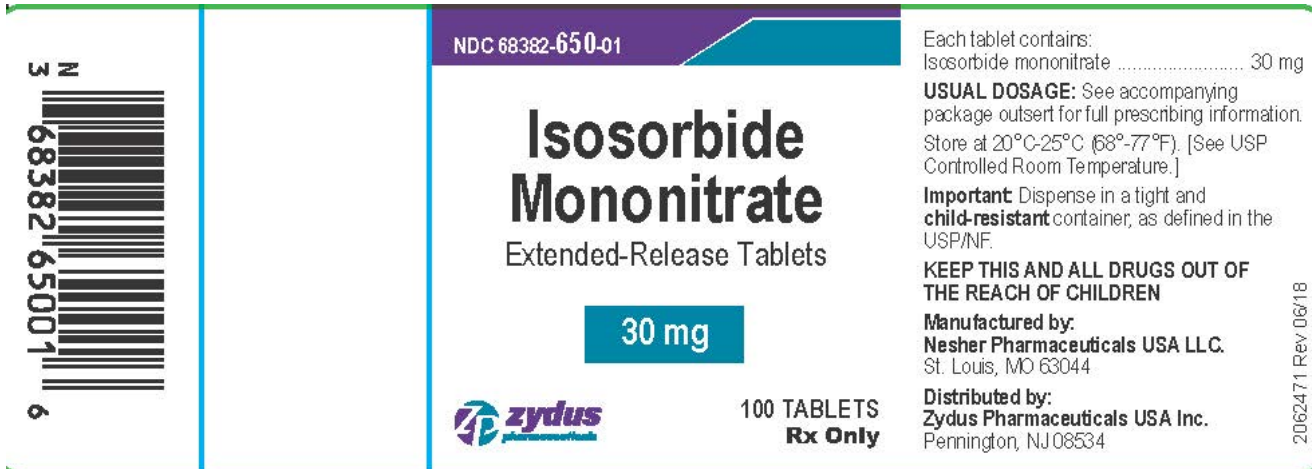
Bottle Label 30 mg 100 count

Principal Display Panel - Bottle Label 30 mg 500 count