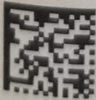
Sincerus Florida, LLC. Adverse reactions

Sincerus Florida, LLC (800) 604-5032 3265 W McNab Rd, Pompano Beach, FL 33069 To report suspected adverse reactions, contact Sincerus Florida, LLC at (800) 604-5032, or FDA at www.FDA.gov/MedWatch or (800) FDA-1088. Office use only. Not for resale.