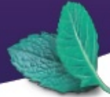
Cool Mint coated tablet