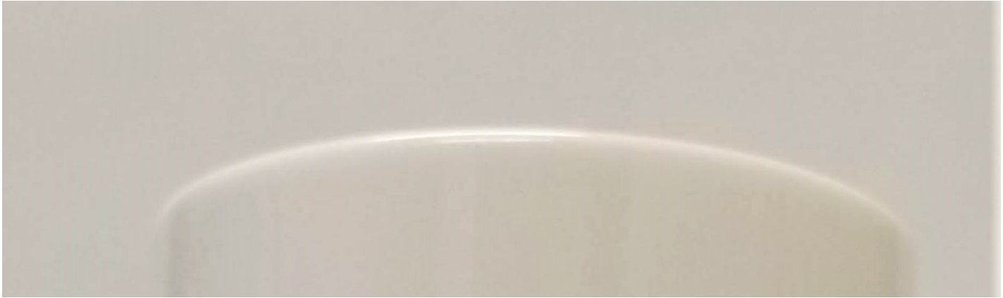
NDC 72934-5159-2 NIACINAMIDE USP 4% / TACROLIMUS USP 0.1%. Ointment 30gm

WARNING: Long-term safety of topical calcineurin inhibitors has not been established. Although a causal relationship has not been established, rare cases of malignancy have been reported. Use of this product should be limited to the treatment of the conditions for which it is indicated.