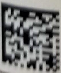
Sincerus Florida, LLC adverse reactions.

Sincerus Florida, LLC (800) 604-5032 3265 W McNab Rd, Pompano Beach, FL 33069 To report suspected adverse reactions, contact Sincerus Florida, LLC at (800) 604-5032, or FDA at www.FDA.gov/medwatch or (800) FDA-1088. Office use only. Not for resale.