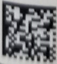
Sincerus Florida, LLC adverse reactions

Sincerus Florida, LLC (800) 604-5032 265 W McNab Rd, Pompano Beach, FL 33069 To report suspected adverse reactions, contact Sincerus Florida, LLC at (800) 604-5032, or FDA www.FDA.gov/MedWatch or (800) FDA-1088. Office use only. Not for resale.