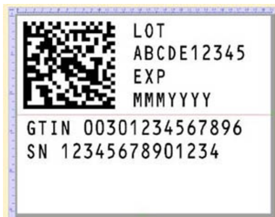
Representative Serialization Image