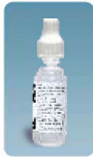
Bottle as received