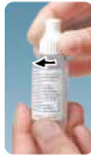
Tighten the cap on the nozzle