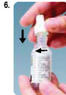
Replace the cap on the bottle. Do not overtighten the cap.

Repeat steps 5 with the other eye if instructed to do so by your doctor.