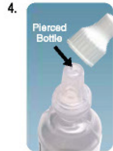
The spike in the cap will pierce the tip of the bottle. To open the bottle unscrew the cap