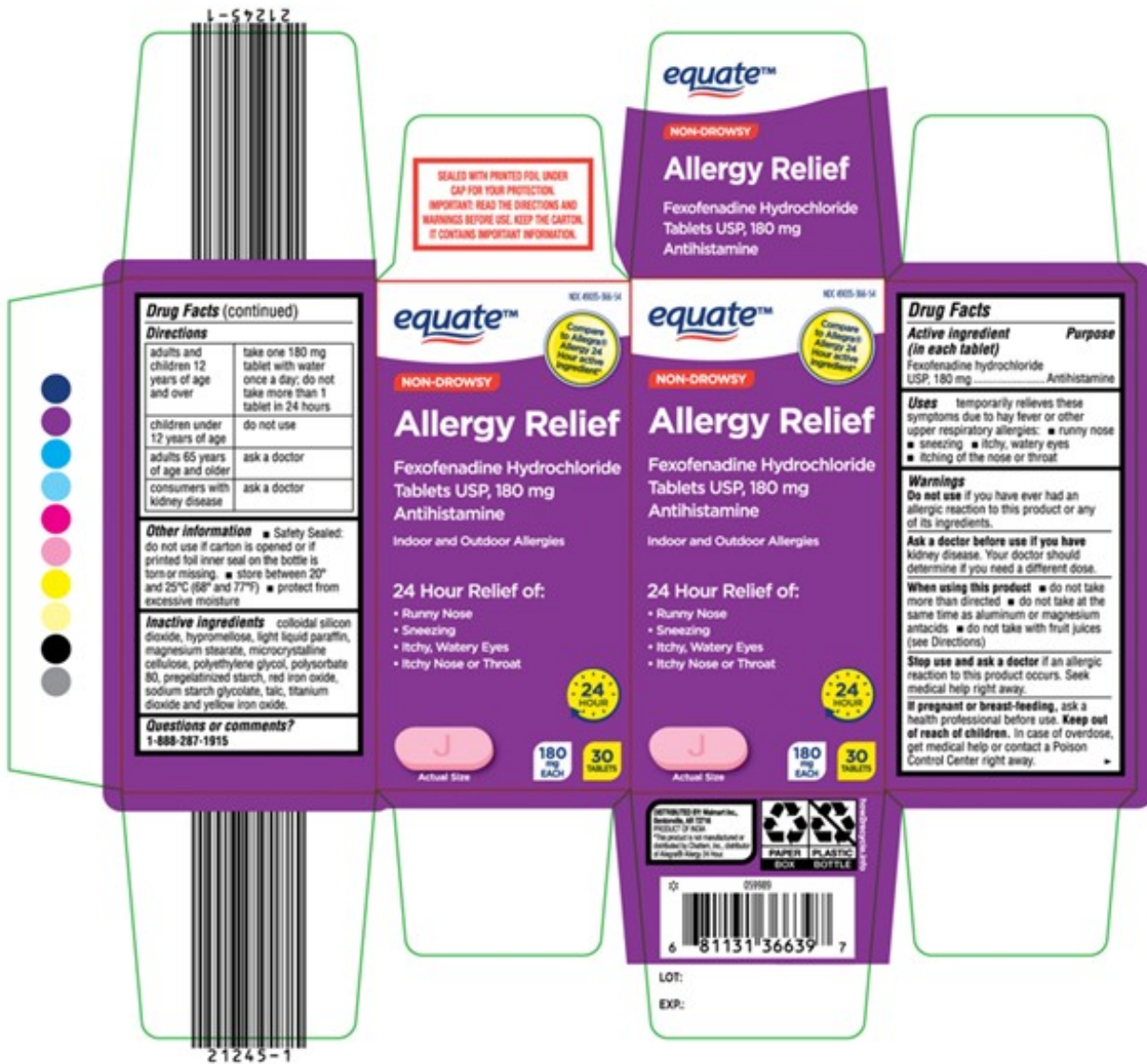
Fexofenadine Hydrochloride Tablets, USP 180 mg 2x30 ct Carton Label