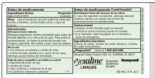
Back 1/8" from die edges