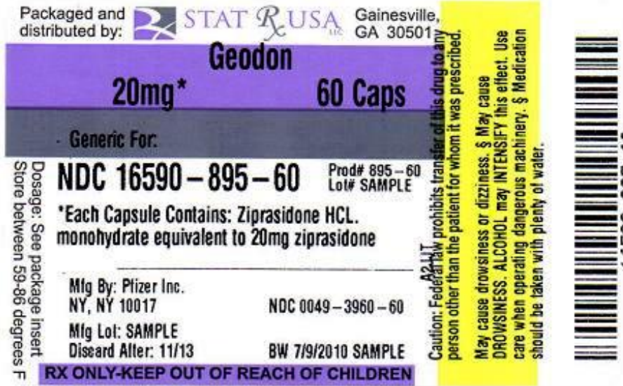
GEODON 20MG LABEL